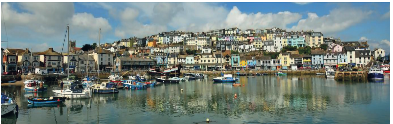
Brixham Harbour